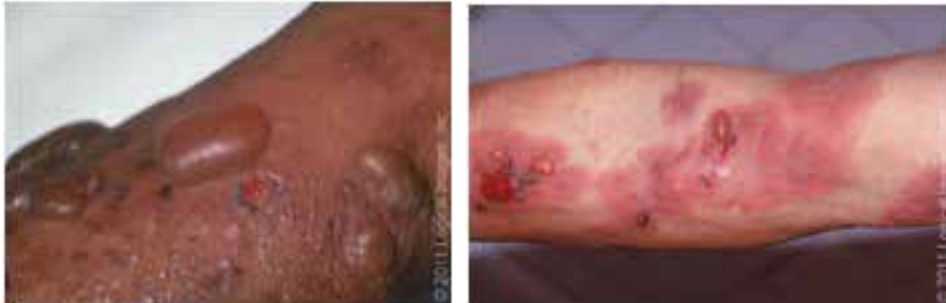
a: Multiple tense bullae on skin with one eroded blister base