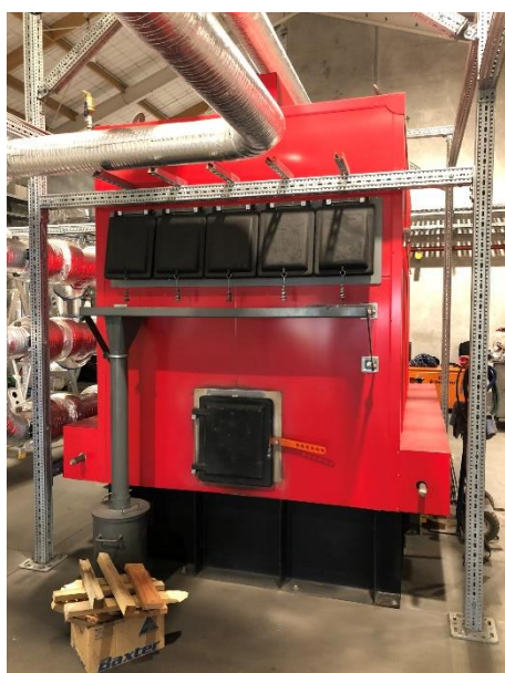
Greymouth hospital boiler