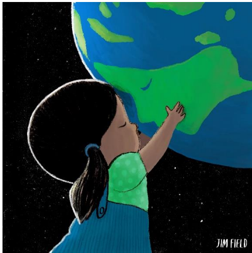
Illustration by Jim Field

OraTaiao: New Zealand Climate and Health Council http://www.orataiao.org.nz/